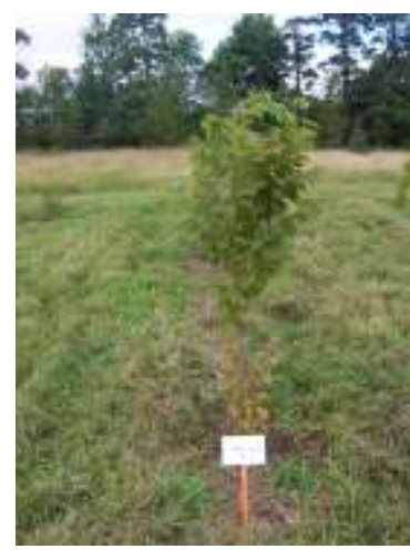
Dwarf hybrid hazelnut fall 2006

<u>Treatments</u>: native beaked hazelnut and 3 hybrid dwarf varieties: Grimo, Winkler and Northern.